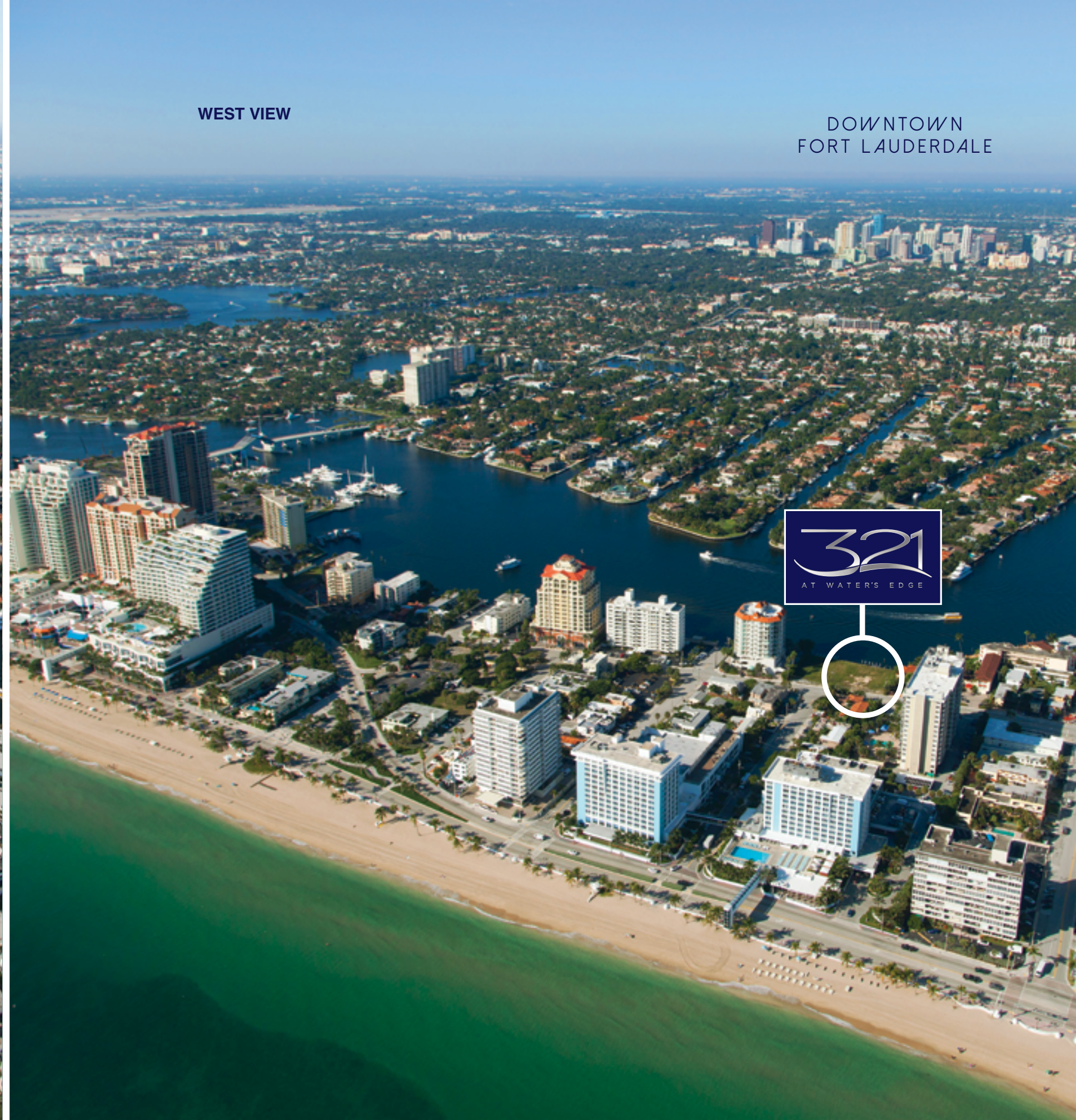
DOWNTOWN FORT LAUDERDALE